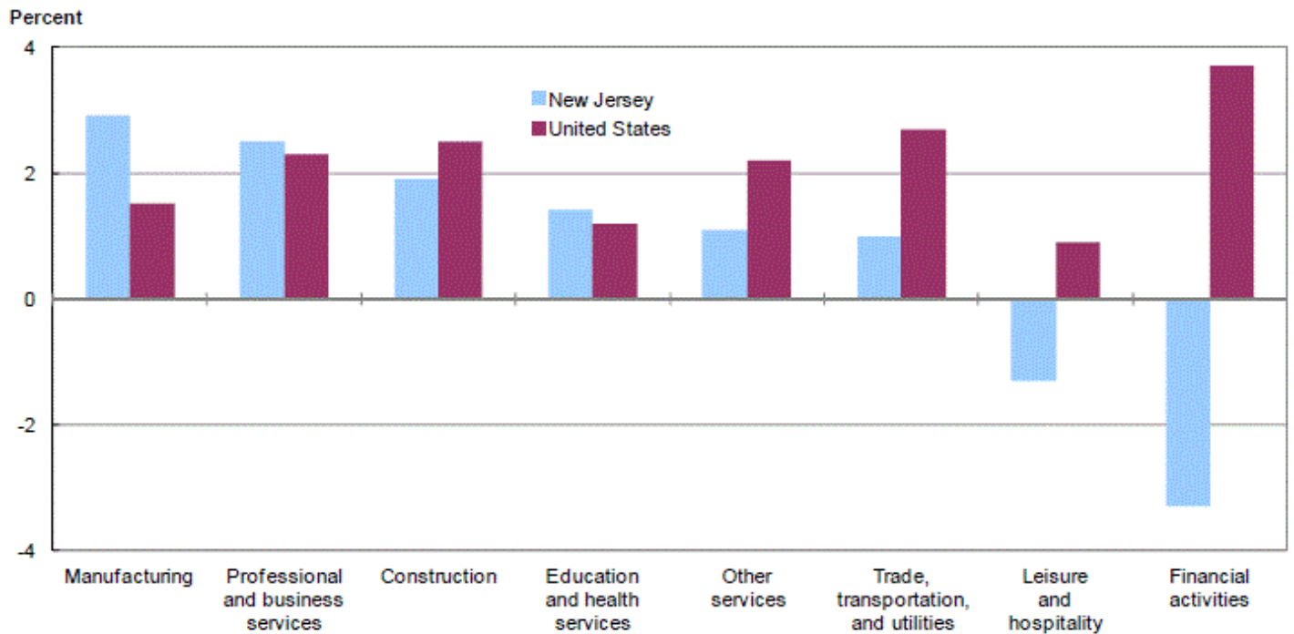
Chart 2. Over-the-year changes in average weekly earnings, by supersector, New Jersey and United States, March 2012 - March 2013